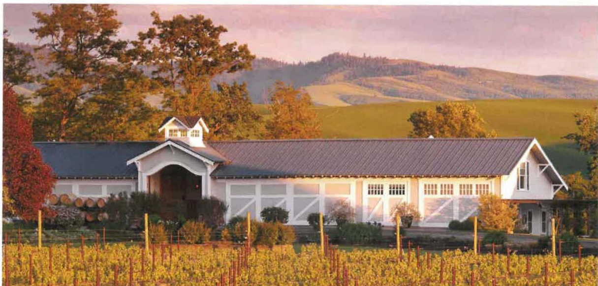
WALLA WALLA (2)

An easy and scenic four-hour drive from Seattle, Boise, or Portland, Walla Walla can also be accessed via Alaska Airlines with direct flights from Seattle. Lewis and Clark, on their westward trek through the area documented the friendliness and welcoming attitude of the people, a factor that encouraged them to stop in the area once again on their return voyage. You too will likely yearn for a repeat visit after a delightful pre- or post-cruise stay in Walla Walla. ●