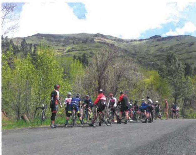
WALLA WALLA (2)