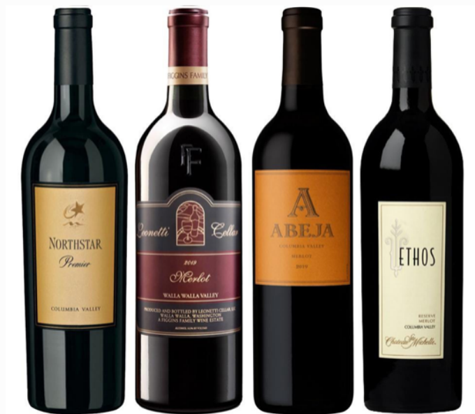
Washington State is a standard bearer for quality Merlot in the U.S. PRODUCERS

While Valentine's Day is a good time to give some love to Merlot, here are seven producers who do that all year 'round.